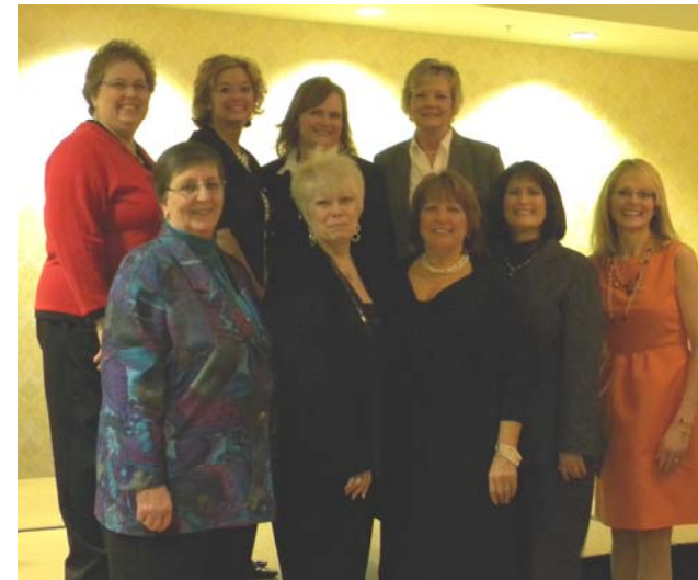
2010 Women of Achievement