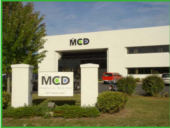
MCD, Inc., formerly Madison Cutting Dye, is a successful printing and finishing company that is located on Madison's east side.

The program begins with a three-week classroom training at the YWCA Annex. Interviews are conducted at the end of the three weeks and those selected for the internship will start immediately. The internship is scheduled Monday through Thursday, first shift from 7:00am-3:30pm, which includes a 30 minute unpaid lunch. Interns will spend Fridays each week at the Annex working on their math and reading skills and attending workshops to enhance their employability.