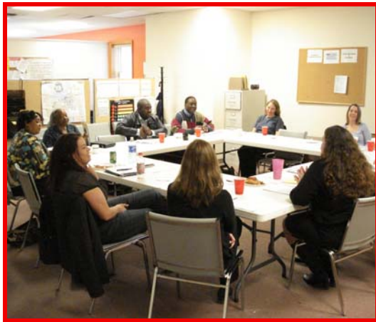
The Displaced Homemaker's Advisory Board Meeting held at the Annex in April.