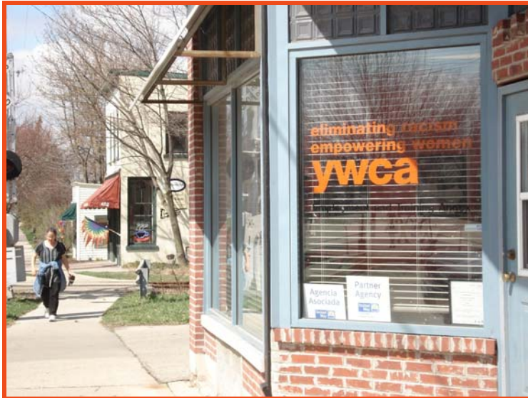
YWCA Employment and Training Annex