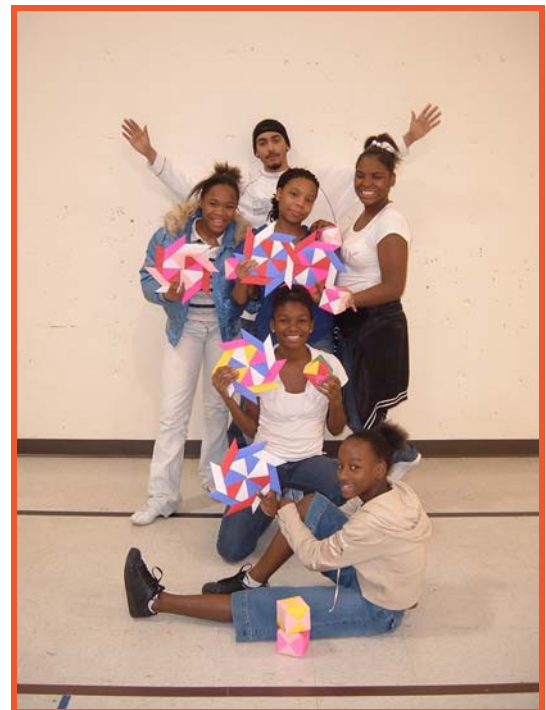
GNP girls pose with a volunteer that taught them origami.